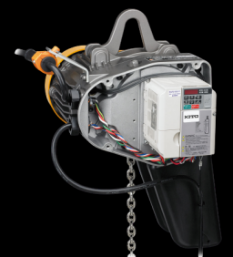
EQ WITH INVERTER